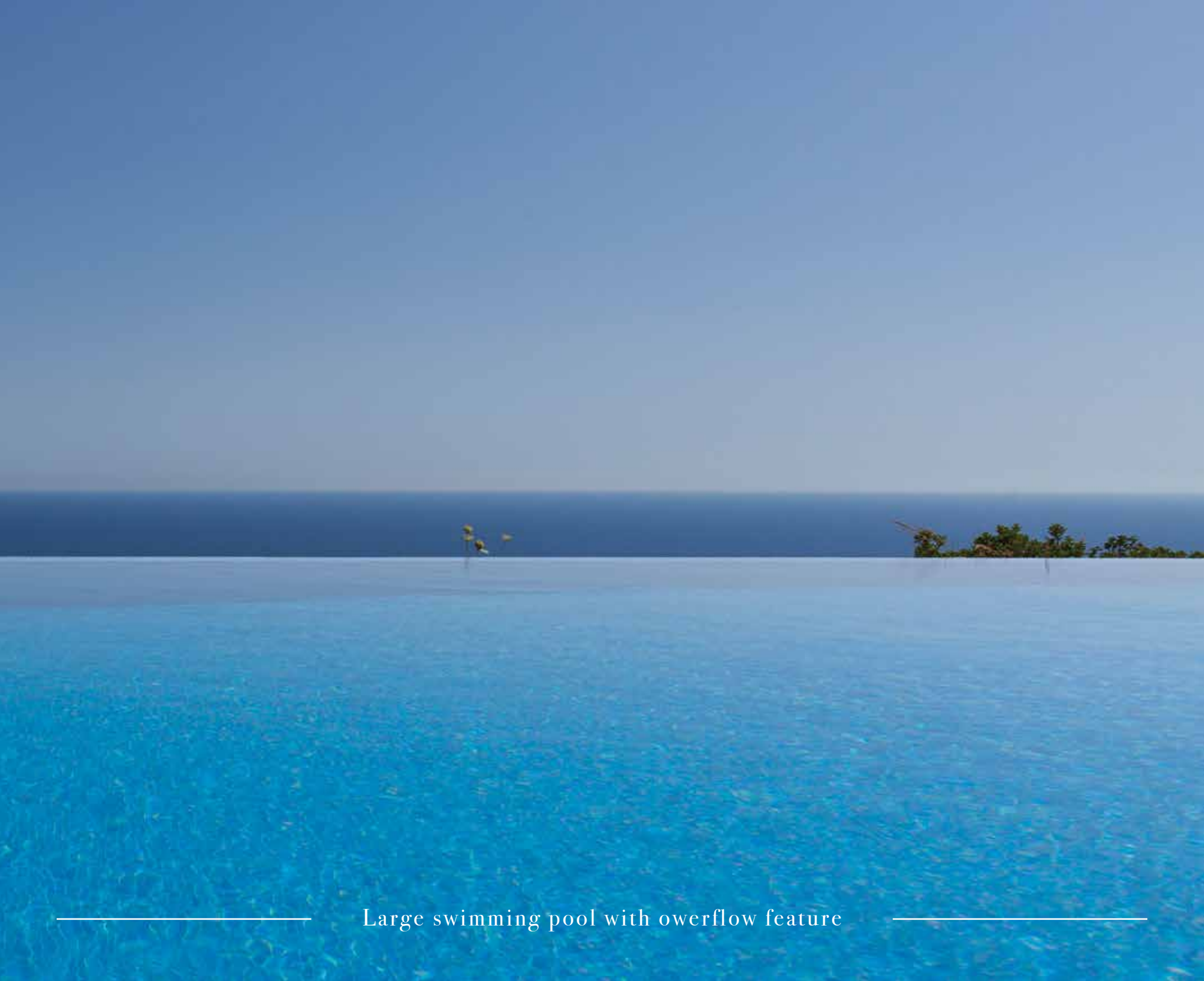
Large swimming pool with overflow feature