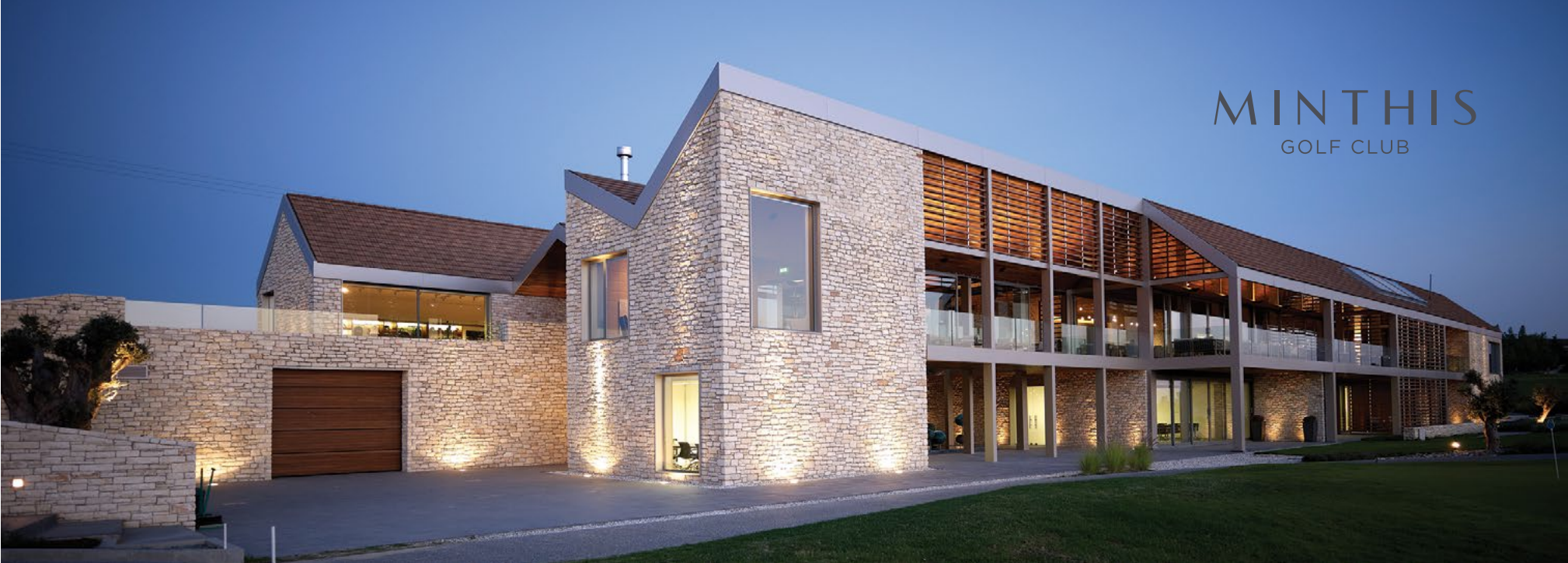
MINTHIS GOLF CLUB

Nestled in a scenic valley by Petra tou Romiou, Secret Valley Golf Course offers stunning settings and friendly, relaxed atmosphere, as well as sheer playability. It utilises the steep hillside terrain for spectacular tee locations and long views towards valley and ocean.