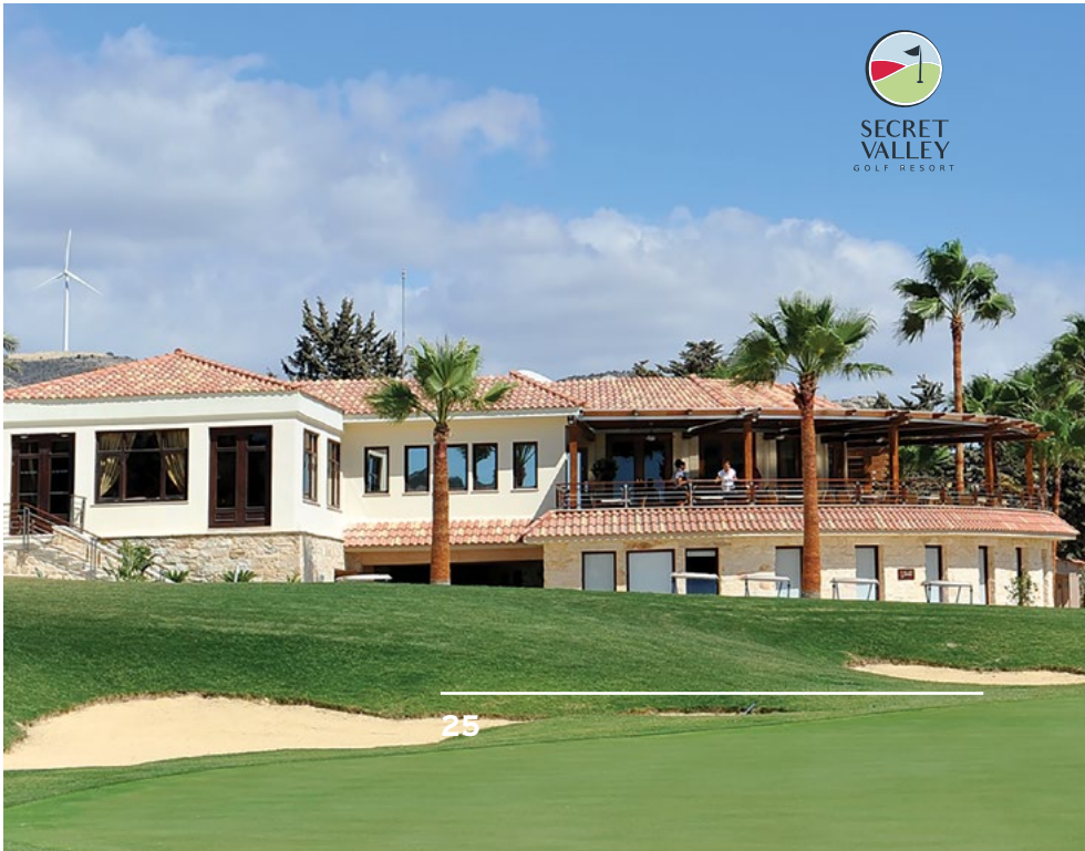
SECRET VALLEY GOLF RESORT