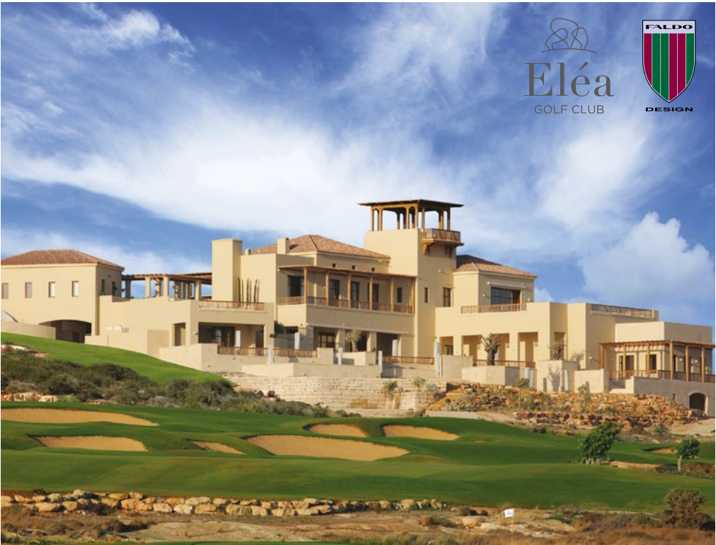
Eléa GOLF CLUB